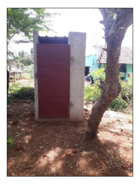
Our IHHTs are very useful for senior citizens. New Anganwadis of FY: 2020-21

We have given the target of 100 numbers of IHHTs constructions for Sivakasi block, Virudhunagar District. But all these constructions will be done by collecting and using the revolving fund (Loan Amount) from IHHT beneficiaries of last financial years. But due to Covid-19 problem/spread as well as non-availability of fund from state SBM department, we have constructed only 20 IHHTs in the district. It was a worst and bad setback for our organization and as well as project. But we keep on trying to collect the revolving fund from beneficiaries and for some cases from state SBM department.