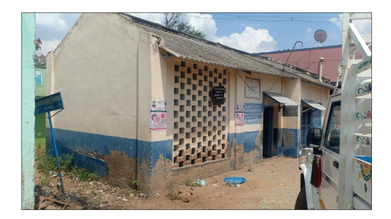
List of Anganwadis renovated in FY: 2020-21