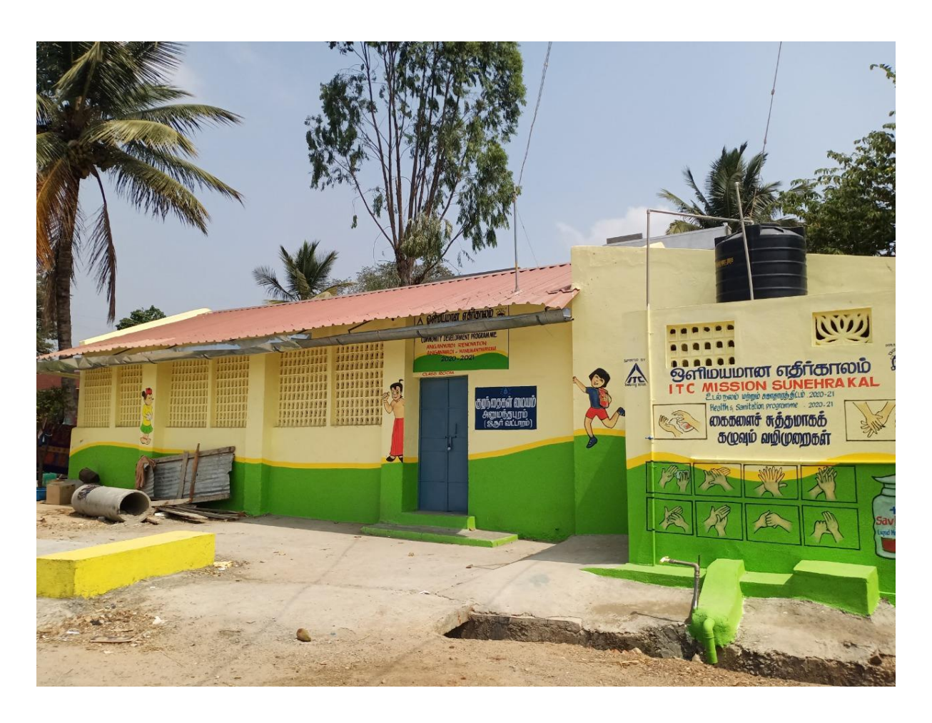
A renovated Anganwadi building at Hanumanthapuram village

This financial year, there are 2 Anganwadis are renovated in Hosur block and before that we have promoted 2 Anganwadi mothers committee to ensure 100 percent backend support. There are 54 children and 61 mothers were benefitted by this Anganwadi renovation program.