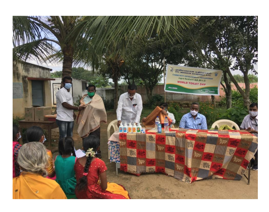
Photo of a World Toilet Day and Covid-19 Awareness program conducted in Hosur Block, Krishnagiri District