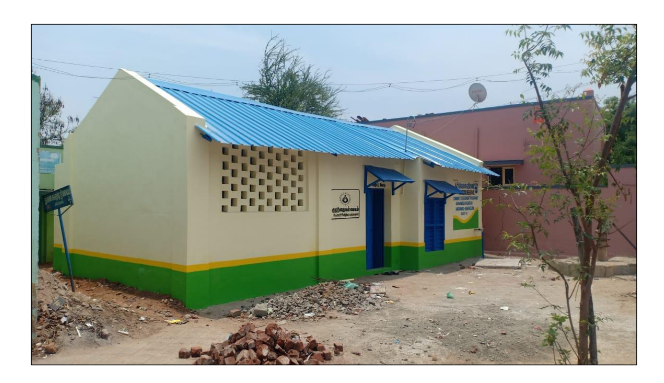
A newly renovated Anganwadi at Gangakulam Village, Sivakasi Block